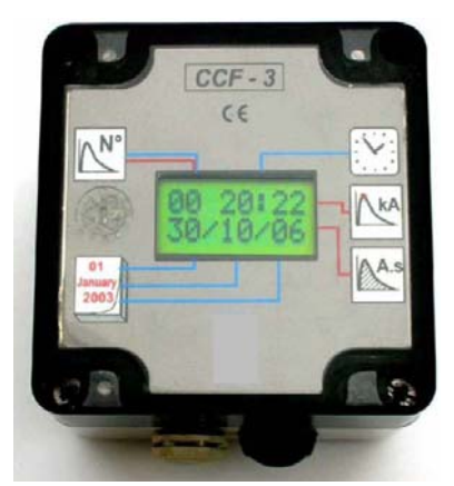
Fig. 1 – Front view of the lightning strike counter.

Access to the lightning counter parameters is easy and can be made by reading directly a digital display with all functions as can be seen in Fig. 1. A button located below the counter allows reading the data recorded for all the strikes that have passed through the counter in a decreasing time order. For each strike, the magnitude, charge, date and time (hour-minute) is recorded. A magnetic link allows changing the button functions for example for changing time (e.g. to move to summer time) and no reset is allowed by the user.