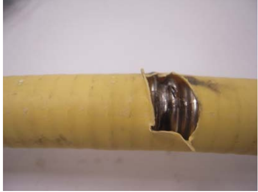
Figure 7. Example of test results - test 6

An additional test configuration was developed to address the scenario where the CSST jacket is damaged during the installation due to rough handling or transportation: By rolling gently rolling a metal tube over the CSST samples, we were able to partially damage the insulation.