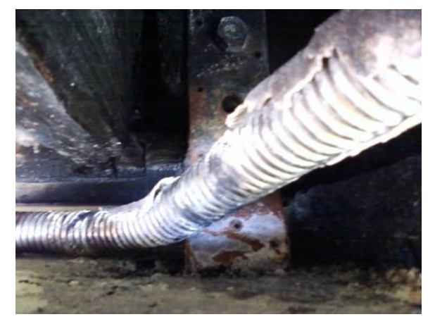
Figure 1. Location of CSST Damage Near a Strap Connected through a Concrete Footing

A link between lightning activity and fires involving CSST piping has been reported in the United States as early as 2003. Damages documented to CSST generally result in one or more holes in the wall of the pipe leading to a release of gas into the structure with no fire, to fire with minimal damage, and in some cases complete destruction of the structure.