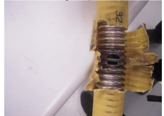
Figure 8. Example of test results - test 12

In these two cases, it was demonstrated by air pressure testing that the sample was leaking. In addition, when the measured voltage obtained during tests is compared with a simulated value taking in consideration the magnitude of current, waveshape, and impedance (both resistance and inductance) measured by an impedance meter, we found that results were on average comparable within 4%.