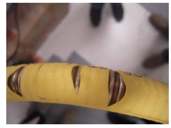
Figure 6. Example of test results - test 10

This damaging mode of the CSST jacket is consistent with some of the damages observed in the field after CSST failed and fire occurred. It is difficult to be conclusive of the fact that this is the result of the lightning stress and not the result of the fire that occurred.