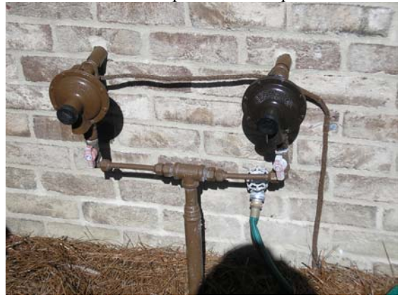
Figure 4. Bonding of incoming gas piping to LPS using main-sized conductor

The second event did not have an eyewitness and no conclusive evidence of a direct strike but the NLDN also showed a confidence ellipse that overlaps the structure