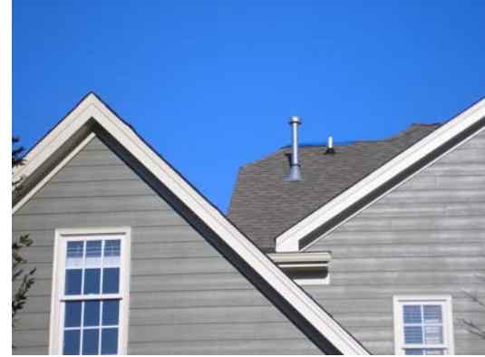
Figure 3. View of vent pipe on roof which served as the strike attachment point

The gas supply to the water heater was provided by a Tconnection with one side coming from the utility room and the other continuing into the laundry room. It is surmised that the CSST piping on both sides of the water heater experienced a significant portion of the lightning current through the piping and finding the path to ground through the electrical service provided to the clothes dryer and the furnance and it is this partial strike current that that caused numerous holes in both sections of CSST pipe.