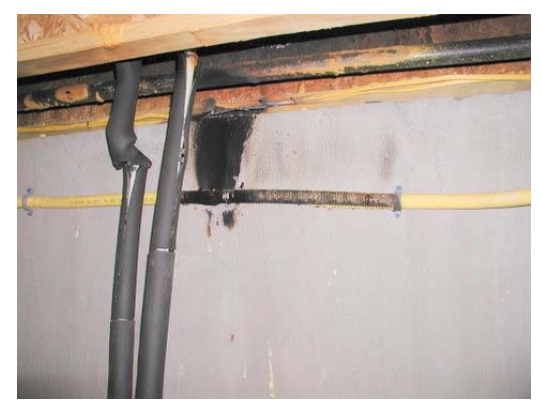
Figure 2. View of damaged CSST near two insulated vertical pipes below horizontal electrical cables and metallic water pipe

An additional scenario for damages could be a direct strike to houses (with or without lightning protection system) and sparkover to CSST with enough charge due to the direct lightning event to create a hole or numerous holes and ignite the gas.